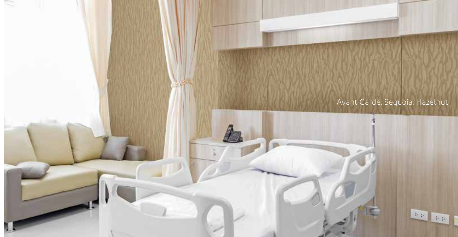
Avant-Garde, Sequoia, Hazelnut

Third-party laboratory testing has proven that Tedlar® film does not support or provide nutrients to assist in mold and bacteria growth, including E. coli .