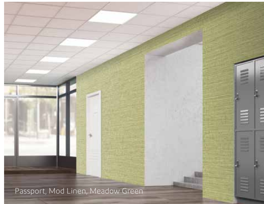
Passport, Mod Linen, Meadow Green